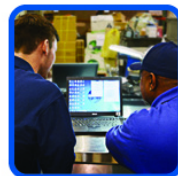
21st Century Experience

800.256.4737 ■ www.gresonsales.com ■ gresonsales@aol.com