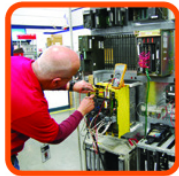
Over 2,400 Test Fixtures