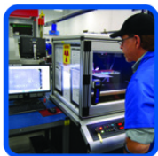
State of the Art Equipment