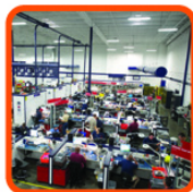
Multiple Locations, Global Presence